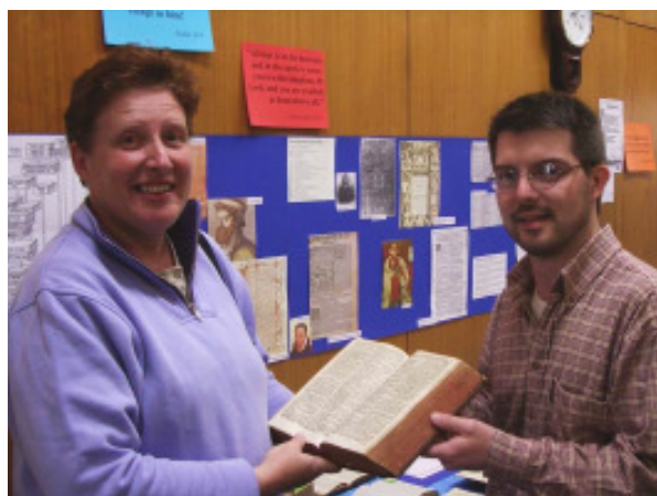
The winning entry, a German Bible about two hundred years old, is pictured above, with its owner on the left.

We had a few entries into our oldest Bible competition. The winning entry was a German Bible (Luther's translation), which was printed around 1800. That's pretty old! The first edition of this Bible was printed in 1775. An even older book that was brought in was a Czechoslovakian prayer book dating from 1742. This was particularly interesting as it was handwritten. One of the problems with such old books as these is trying to preserve them so they don't just fall apart. Therefore when the Bibles were judged, there was a talk about the care of Bibles and old books.