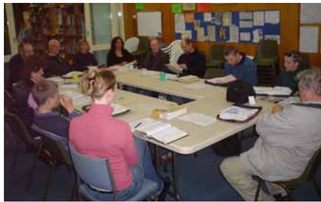
Discussion group in action

A very interesting range of small publications on Bible subjects and related issues—many of which have been puzzling Christians over many years—so make sure you drop into the Bible Centre at 46 Walker Street Dandenong soon!