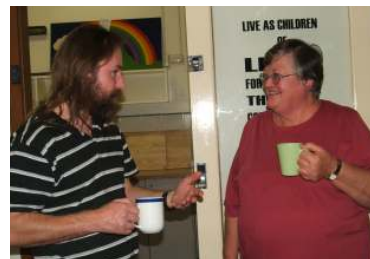
Sharing supper while talking about the Bible

Topics covered include the Kingdom of God, the fruit of the Spirit, money, the devil and