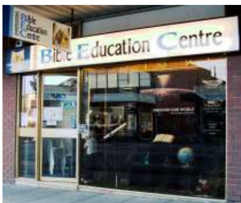
Come and visit 46 Walker St, Dandenong during Education Week—open day is May 12!

The highlight of the week will definitely be the Open Day on Saturday May 12. In addition to the interesting displays there will be a coffee shop from 2-5pm. Have a drink and some cake while you listen to live music. Make sure you cut out and bring your voucher from