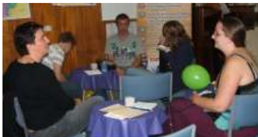
Relax and chat