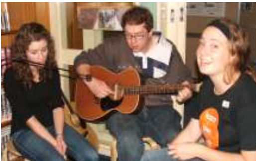
Praising God—live music is enjoyed