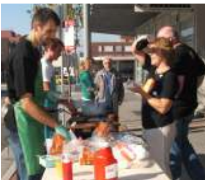
Does anyone want a sausage?