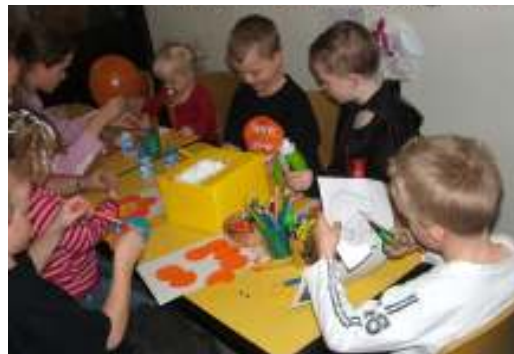
Let's make Daniel's lion—or David's sheep!