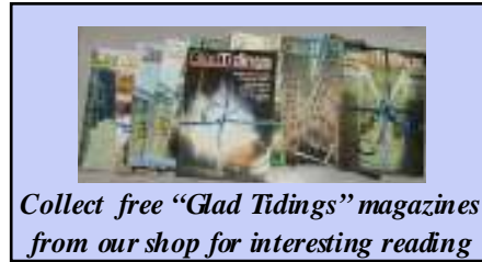
Collect free "Glad Tidings" magazines from our shop for interesting reading