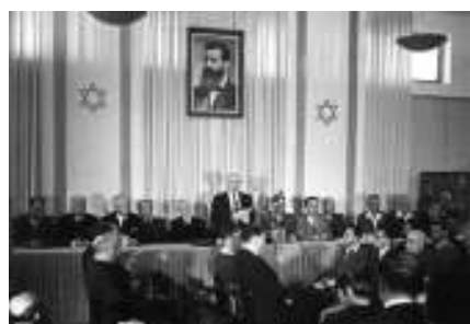
David Ben-Gurion publicly pronouncing the Declaration of the State of Israel, May 14 1948.

The nation of modern Israel has just turned 60 years old. Of course Israel was a nation in Bible times but for almost 2000 years there was no nation called “Israel”. In May 1948 the state of Israel was proclaimed.