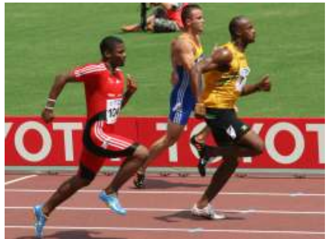
(World Athletics Championships 2007 in Osaka)

You can win in this race – even if you aren't an Olympic champion. Read the instruction book, the Bible, to find out how you can be given the prize of eternal life on earth, when Jesus returns.