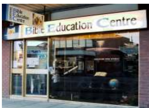
The current shop at 46 Walker St, Dandenong What will the new premises look like? Just watch.

Walking in the streets near the Dandenong Bible Education Centre shows that something is going on! Most of the shops are shut. In fact VicUrban has acquired them as part of the Dandenong redevelopment plans. So the Bible Centre has found a new "home". Watch what happens at 118-120 Foster Street in the coming weeks. A new and expanded Bible Education Centre is being developed and you'll want to visit once we move to the new premises! Plans are underway for a larger bookshop and library, as well as a course room for learning more of the message of the Bible. We will let you know when it will open, but in the meantime you can watch for signs in the window. Activities will continue in our current shop, so keep coming in. In fact you may want to come in for a 'progress report'!