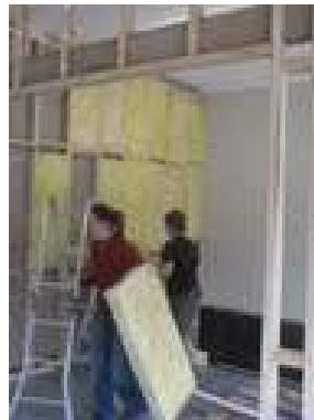
Putting insulation in the walls