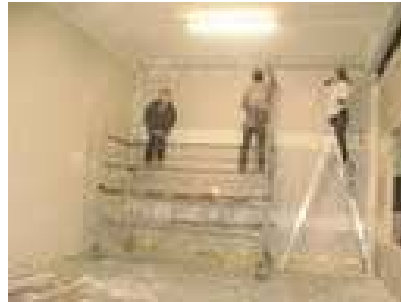
Cornices and patching