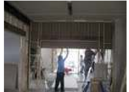
Removal of back roller door to prepare for the double door or disabled access