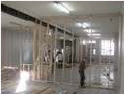
Frames are put in for internal walls